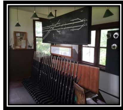
"BF" Model Board & Controls