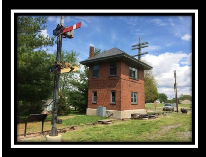
Bradford, Ohio "BF Tower"