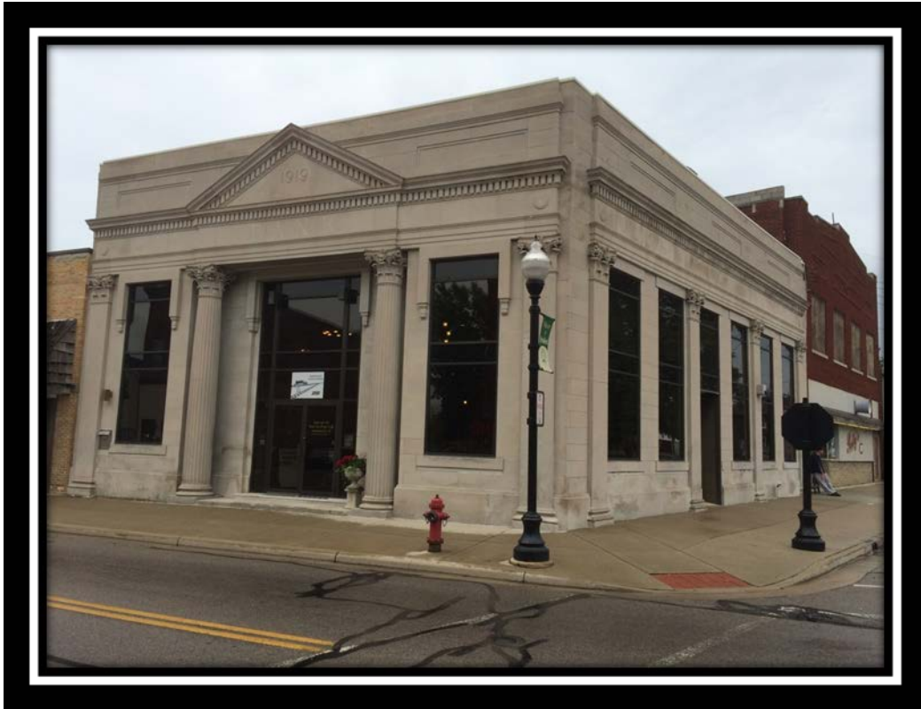
Bradford Railroad Museum. Photo by Ron Widman, 2016