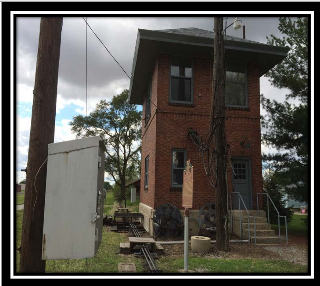
Bradford "BF Tower". Photo by Ron Widman, 2017